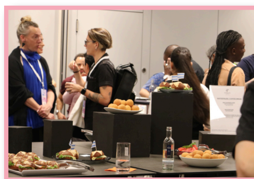
From the networking space at the Global Trans Conference