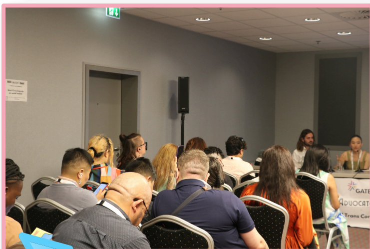
Below: Participants engaging in a breakout session