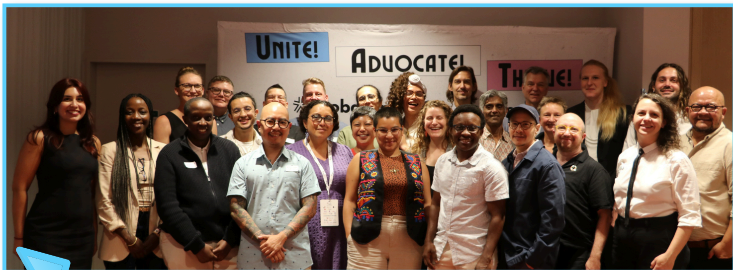
Participants from the Donor Pre-Conference in Munich, Germany

The central aim of the Pre-Conference was to foster a collective understanding of the pressing needs within the trans and gender diverse community, and to develop innovative funding strategies to support the movement in responding to ongoing challenges and emerging opportunities. The Pre-Conference was not a stand-alone conference. All stakeholders attending the Pre-Conference also attended the Global Trans Conference as participants actively listening and contributing to the global conversation.