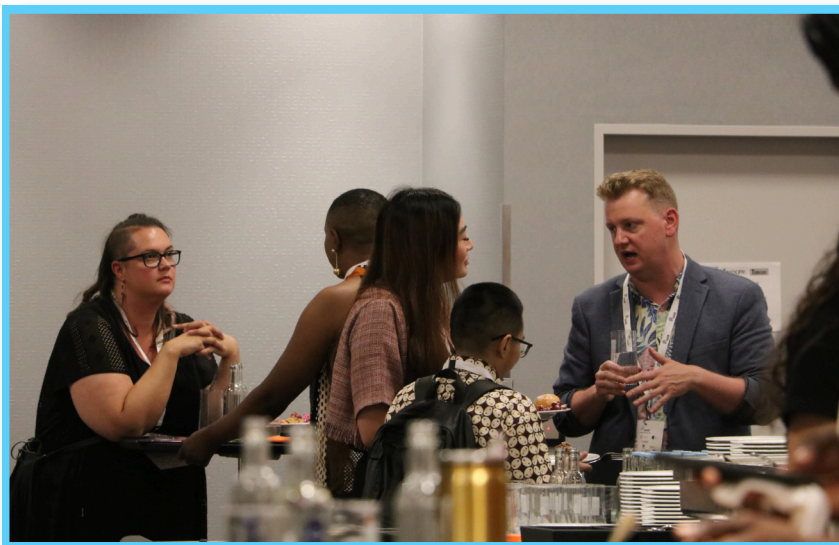
Participants and donors engaging in the networking space

Also highlighted was that flexible funding models are equally crucial, as they allow organizations to allocate resources where they are most needed, whether in response to urgent crises or long-term capacity building. This flexibility is particularly important for trans and gender diverse communities, who often face rapidly-changing and hostile environments that require swift and adaptive responses.