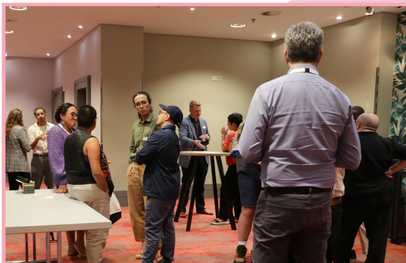
From the networking space at the Donor Pre-Conference

The Pre-Conference was driven by several key goals.