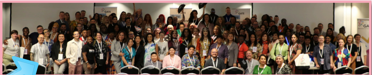
Group photo of some of the delegates from the "Unite! Advocate! Thrive!" Global Trans Conference, Munich, Germany