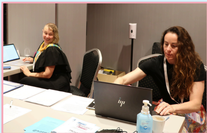
Logistics behind the scenes

future initiatives. The outcomes and discussions from this Conference that will be integral to shaping and advancing future initiatives, and will continue to influence and drive major community actions and events in the coming years.