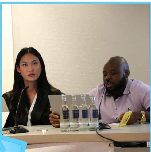
Left, from left to right: