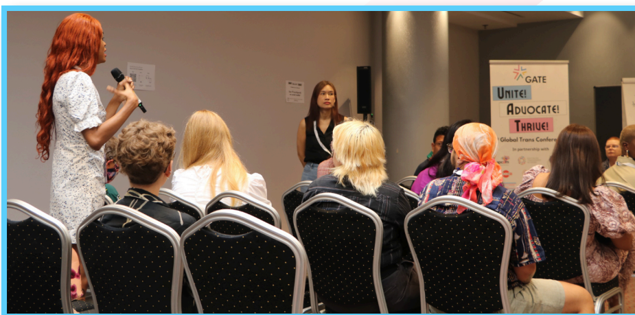
Participants engaging in a breakout session

The Health track at the Global Trans Conference underscored the urgent need to address health disparities within trans and gender diverse communities. The discussions centered around the importance of advocacy for equitable access to health services, community-led research, differentiated service delivery, and participatory co-design. These themes align closely with GATE's existing goal to advance health rights and access to health services for trans and gender diverse individuals.