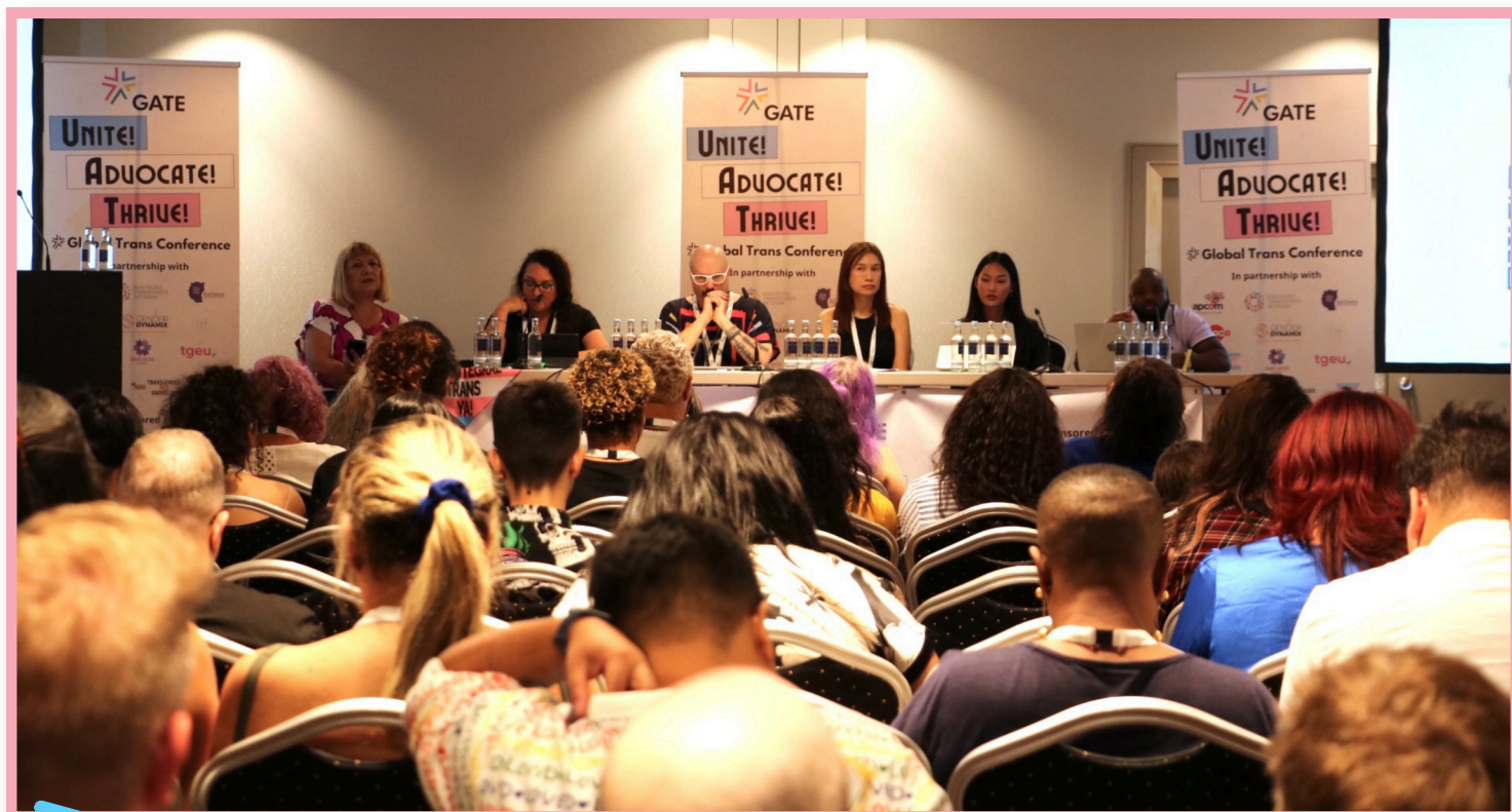
From the closing plenary of the Global Trans Conference

The road ahead is challenging, but with a collective commitment to these principles, we can build a funding ecosystem that truly reflects the values of equity, autonomy, and resilience.