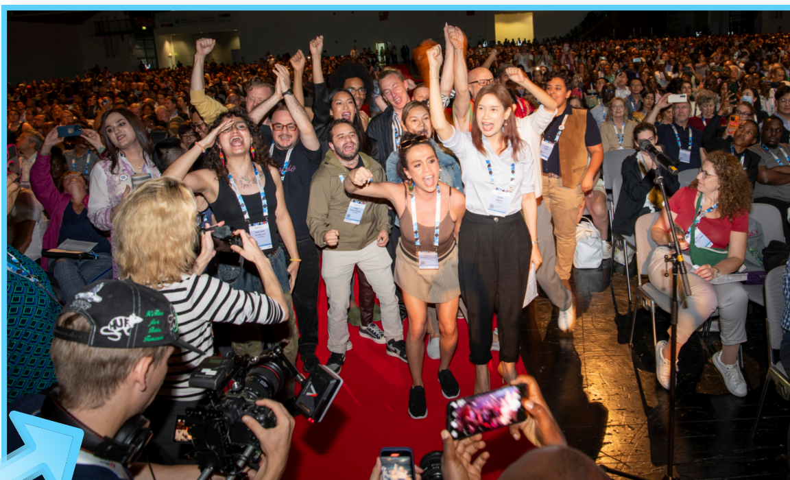
Trans and gender diverse demonstration with the reading of the Global Trans and Gender Diverse Declaration at the Opening Session of the AIDS Conference, Munich, Germany

The impact of the Conference extended into the International AIDS Conference itself, where trans and gender diverse activists made their presence felt. During the AIDS Conference opening ceremony, 20 trans and gender diverse activists made a significant impact by interrupting the proceedings to read aloud the Global Trans and Gender Diverse Declaration . This Declaration, initially launched at the closing of the Global Trans Conference, serves as a powerful tool for activists to take back to their communities, where it will continue to inform and strengthen their ongoing work. This bold action demonstrated the Conference's influence and the determination of trans and gender diverse activists to ensure that their voices are heard in global forums.